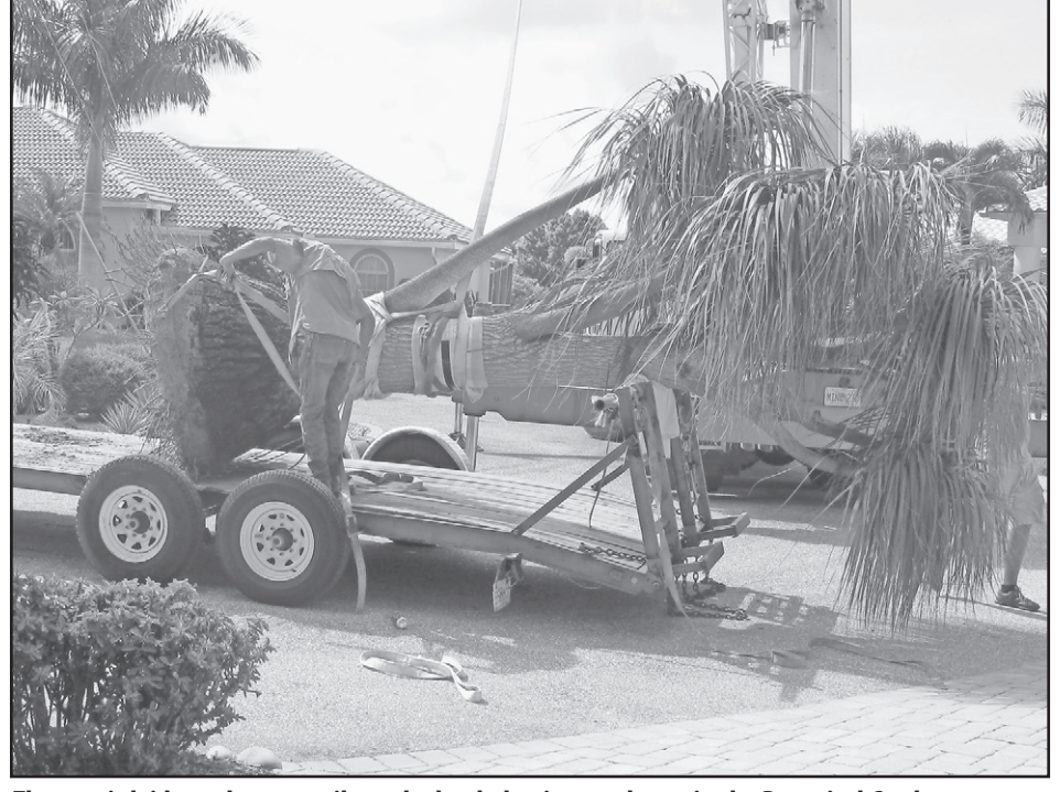
The tree is laid gently on a trailer to be hauled to its new home in the Botanical Gardens.

The ponytail tree has joined that landscape, standing as a focal point of the future.