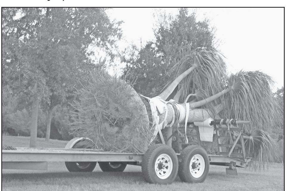
The tree is hauled into the Gardens.