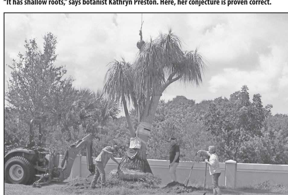
As workers guide it in, the ponytail tree settles into its new home.